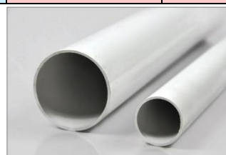
Fig.2 RSHF white

Share capital: PLN 5,726,000.00 NIP: 681-18-27-742 REGON: 350141778 KRS: 0000118321