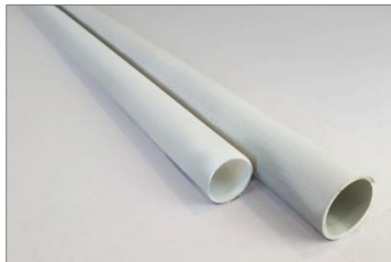
Fig.3 RLHF grey