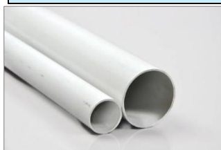
Fig. 1 RLHF and RSHF white pipe