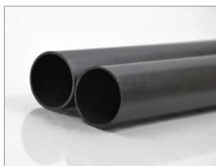
Fig. 5 RLHF, RSHF black