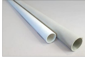
Fig.4 RLHF pipes white and grey